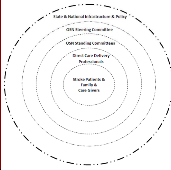
Oregon Stroke Network Organizational Structure